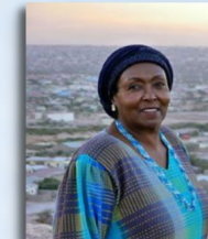
Dr Edna Adan Ismail Humanitarian / Former politician in Somaliland. Activist against female genital mutilation. Director and founder of the Edna Adan Maternity Hospital